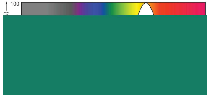
Spectral Power Distribution Colour - MAS LEDspotLV VLE D6.3-35W 827MR16 36DRS